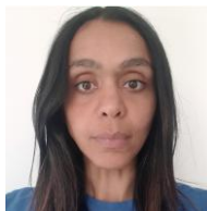
Noellie Broohm Photographer